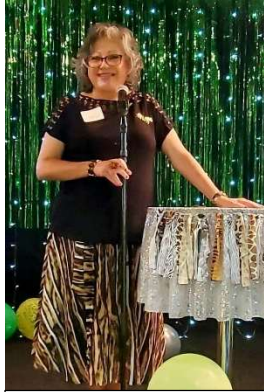
Women's Breakfast - Ministry Event