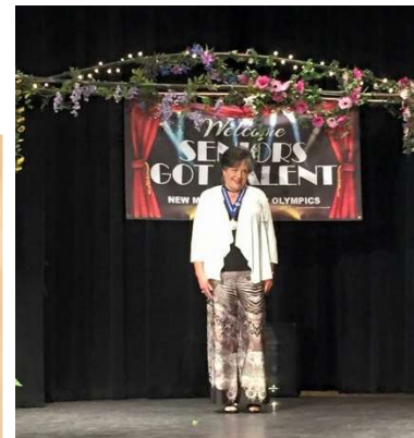
2015 Gold Medal – Grand Champion NMSO Seniors Got Talent