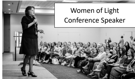
Women of Light Conference Speaker